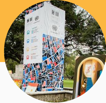
42 Habitat III Village Projects