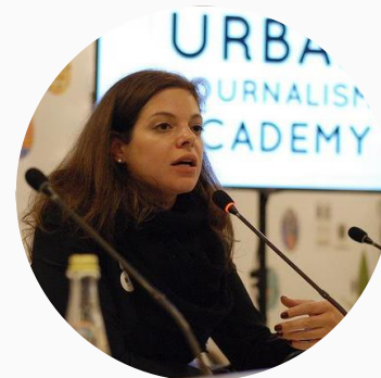
1 Urban Journalism Academy