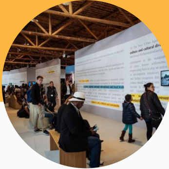
59 UN Events