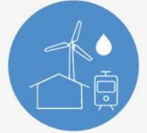
Urban Housing and Basic Services