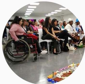
22 Special Sessions