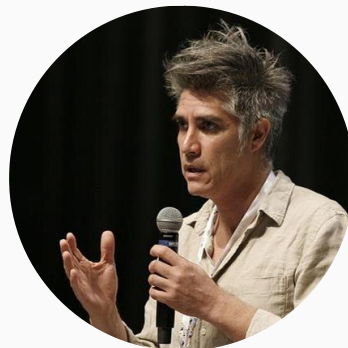
3 Urban Talks