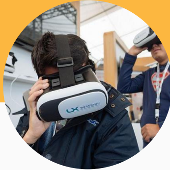
57 Exhibition Booths