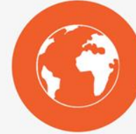
Urban Ecology and Environment