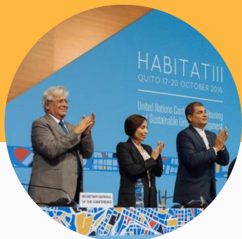
8 Plenary Meetings