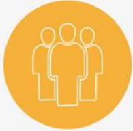
Social Cohesion and Equity