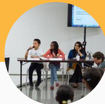
16 Stakeholders Roundtables