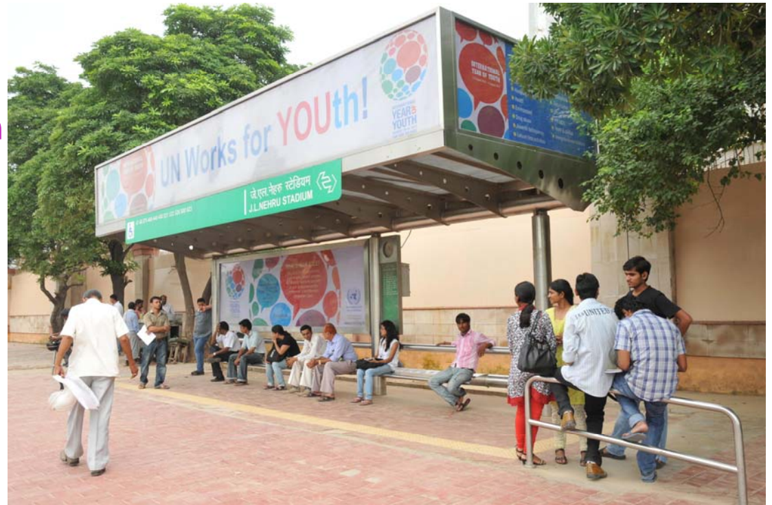
Bus Stand in Delhi